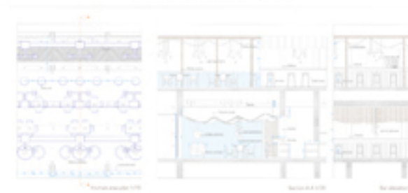
Dining area details