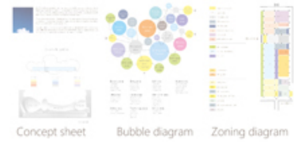
Concept sheet Bubble diagram Zoning diagram