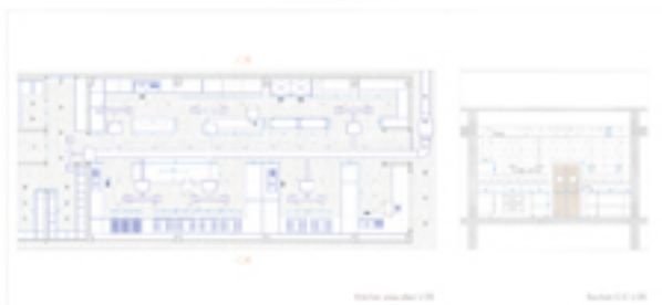
Kitchen area details