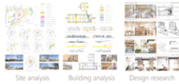
Site analysis Building analysis Design research

The cuisine is international. Starting at 7am from Monday to Sunday till 11pm. At weekend there are some nice courses for parents and their children. Parents can participate some different seminars and in the same time their children can cook paste, cakes or play with their cousins. In the interior used bright palette and a lot of natural light to create a very welcoming atmosphere.