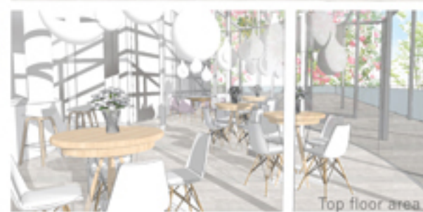
Top floor area