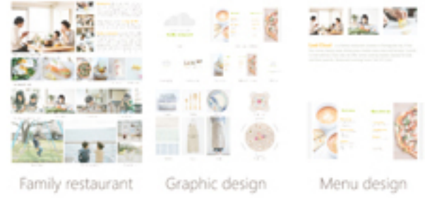
Family restaurant Graphic design Menu design