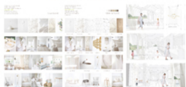
Mood board Material board Concept idea