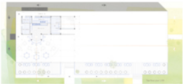
Top floor plan