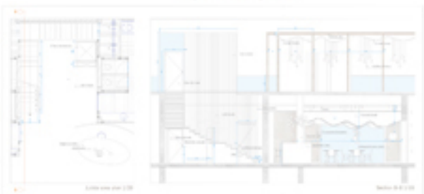
Lobby area details