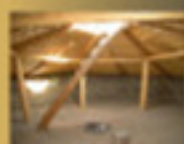
BASIC TRIBAL LODGING