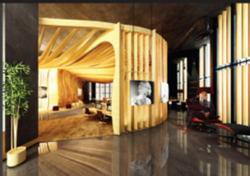
THE IDEA CREATION LINE, WHERE ALL THE DESIGNERS ARE LOCATED ON A CURVILINEAR PATH