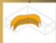
CURVILINEAR WITH STRONG WALLS