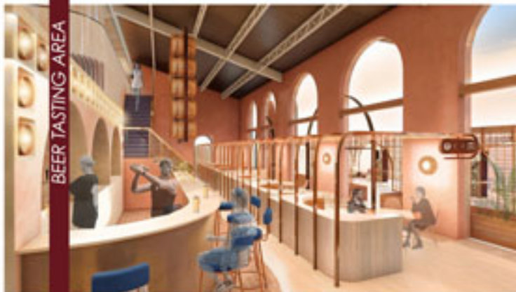
BEER TASTING AREA