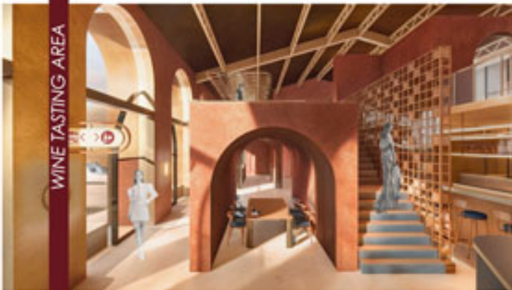
WINE TASTING AREA